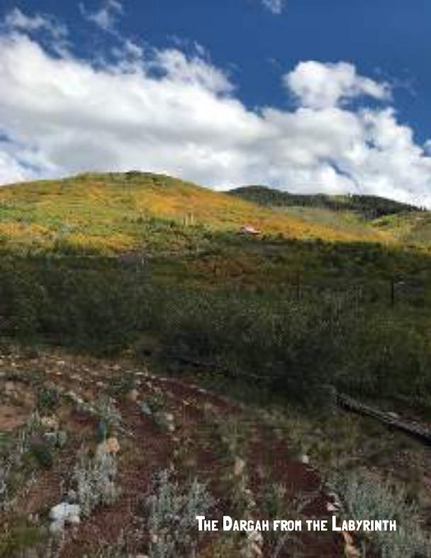
THE DARGAH FROM THE LABYRINTH