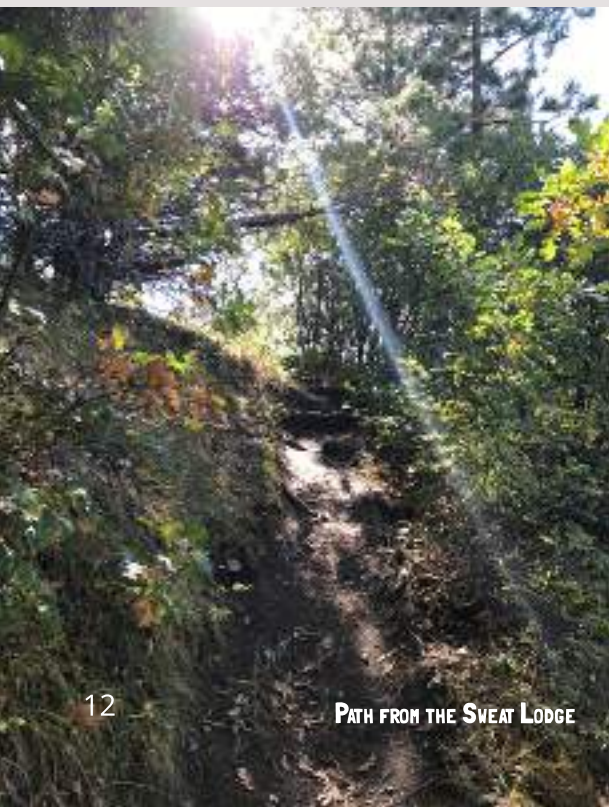
PATH FROM THE SWEAT LODGE

"When I dance here this place allows me to touch the core of my own spirit." Zuleikha