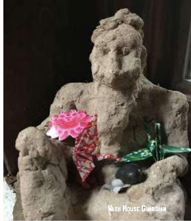
WASH HOUSE GUARDIAN