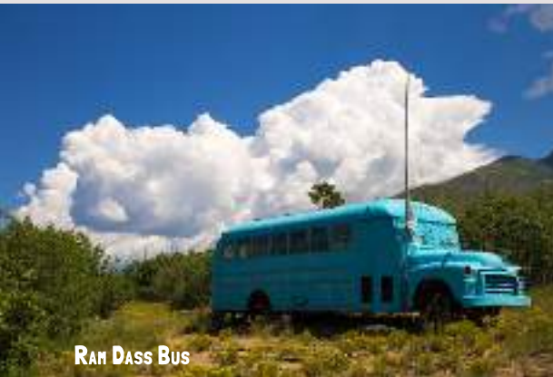
RAH DASS BUS