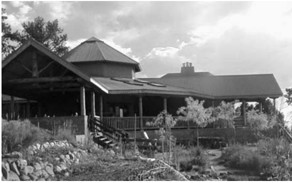
The Community Center Complex