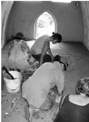
Vault One - 2004