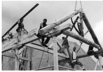
Community Center Portal - 1999

Starting in the summer of 1996, thousands of willing hands came up and felled trees along the contours of the land to preserve the top soil, planted baby trees, developed a long-term building site plan, and worked diligently to complete new buildings. For several years, the task was overwhelming because building projects during the busy summer season competed with serving summer retreats, growing food, and enjoying the fruits of Community. However, because so many believed in Lama Foundation's vision and supported it with donations and/or their time, Lama has not only risen from the ashes, it is soaring!