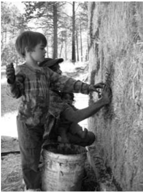
Everybody likes to plaster