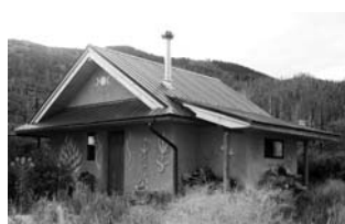
The Eco Nest