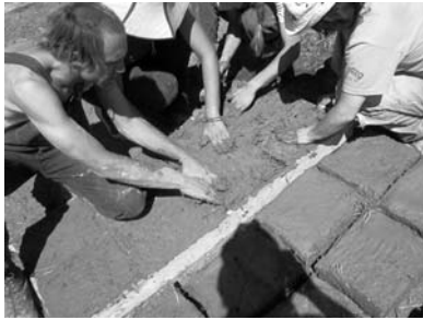
Making Adobe Bricks - 2004