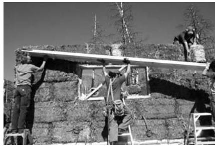
Keyline - 2003