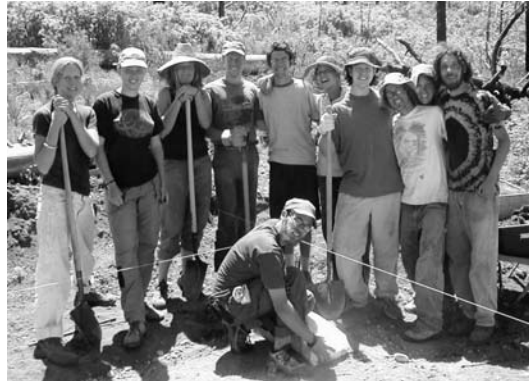
BHN Apprentices - 2003