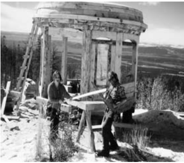
Maqbara Hermitage - 1997