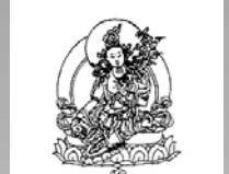
Green Tara Green 19"x19" $5.00

Help to complete our new Cottage Industries Building! $2 of every Flag and $10 of each Flag Set sold by 06/30/07 will go directly into the building fund for this special project! See our complete line of Prayer Flags and Flag Sets on our website.