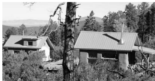
The Greensong and the Keyline