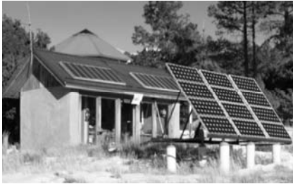
The Solar Shed & Panel Array