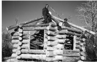
The Kanaat - 2000