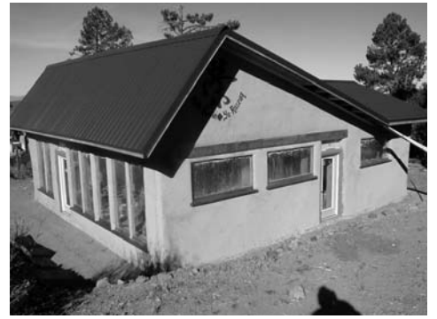
Flag Mountain Cottage Industries