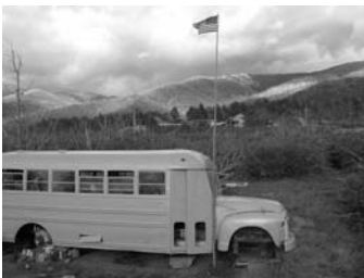
The Ram Dass Bus got a new paint job