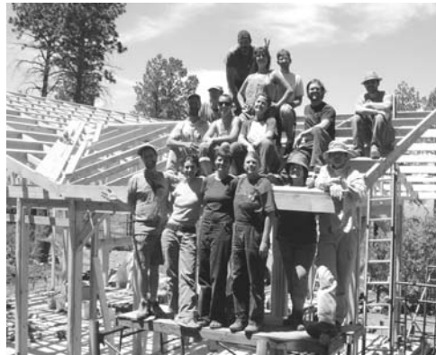
BHN Apprentices - 2006