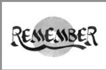
Remember Purple & Blue 19"x 26" $7.00