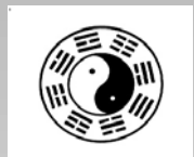
Yin Yang Black 19"x19" $5.00