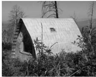
The Bear Hermitage