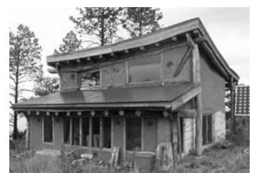
The Tree House