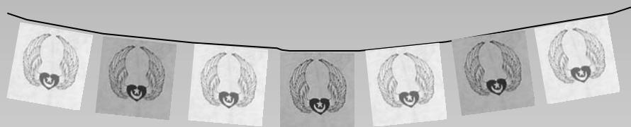
Sufi Heart & Wings Set Printed on hand-dyed fuchsia, bright yellow, and turquoise flags. $35.00