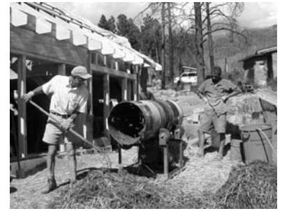
The Workshop - 2002