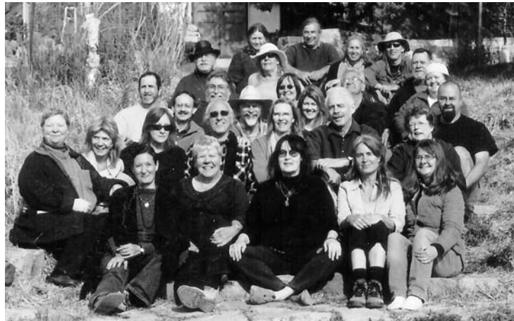
Dervish Healing Order - 2006