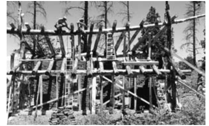
The Tree House - 1998