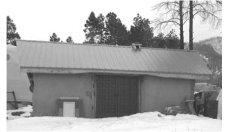
The Recycle & Storage Shed