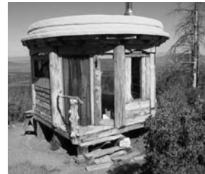
The Maqbara Hermitage